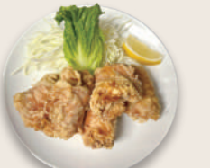
12. Chicken Karaage S 8.99/ L 16.99 Japanese-style fried chicken, marinated garlic ginger sauce