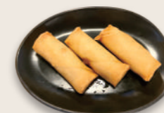
2. Veggie Spring Roll (3) 4.99