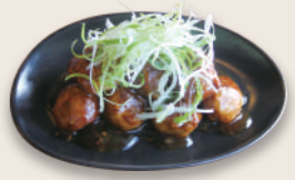
8. Meatball 7.99 Beef meatballs with sweet and sour sauce