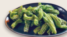
10. Shishito Garlic 7.99 Sauteed Japanese chili pepper with garlic.