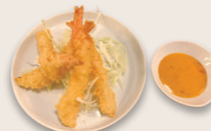
9. Shrimp Tempura (4) 7.99 Korean spicy pickled nappa cabbage