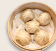
7. Pork Xiaolong Bao (5) 6.99 (15min) Steam soup dumpling