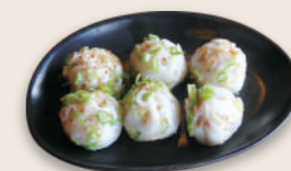
11. Pork Gyoza (6) 8.99 (15min)