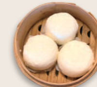
6. Golden Lava Buns (3) 5.99 (10min)