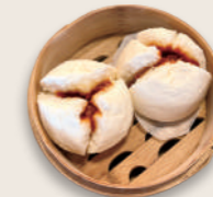
3. Chashu Pork Buns (2) 4.99 (10min) BBQ chashu pork buns