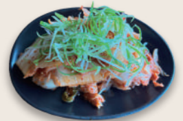
4. Kimchi 4.99 Korean spicy pickled nappa cabbage