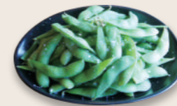
1. Edamame 4.99 With sea salt