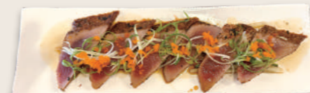
13. **Pepper Tuna 7.99 Pepper tuna with ponzu sauce, masago, scallion