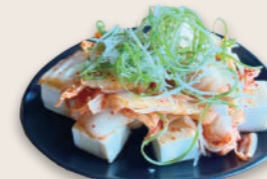
5. Kimchi W. Tofu 5.99 Cold tofu, kimchi, green onion, white sesame, dashi-soy sauce