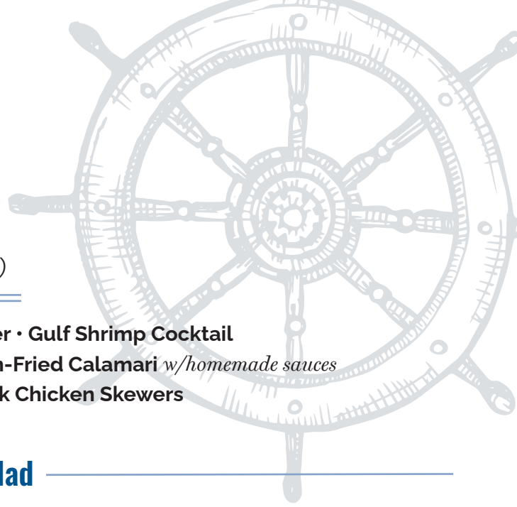
Table Share or Stationary Appetizers (choose two)

Big Fish Bruschetta w/homemade garlic toast • Crudites Platter • Gulf Shrimp Cocktail Blackened Chicken Quesadillas • Hand-Breaded and Flash-Fried Calamari w/homemade sauces Spinach & Artichoke Dip w/fresh tortilla chips • Jamaican Jerk Chicken Skewers