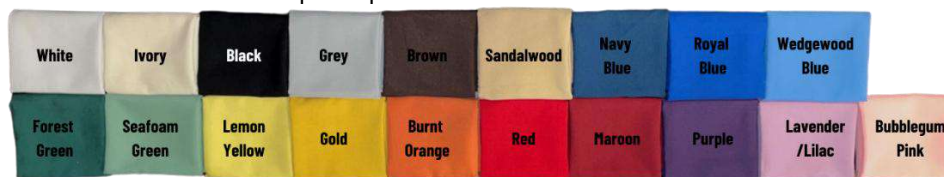
Table Linens: White, Ivory, or Black available Napkin Options: Custom Folds Available