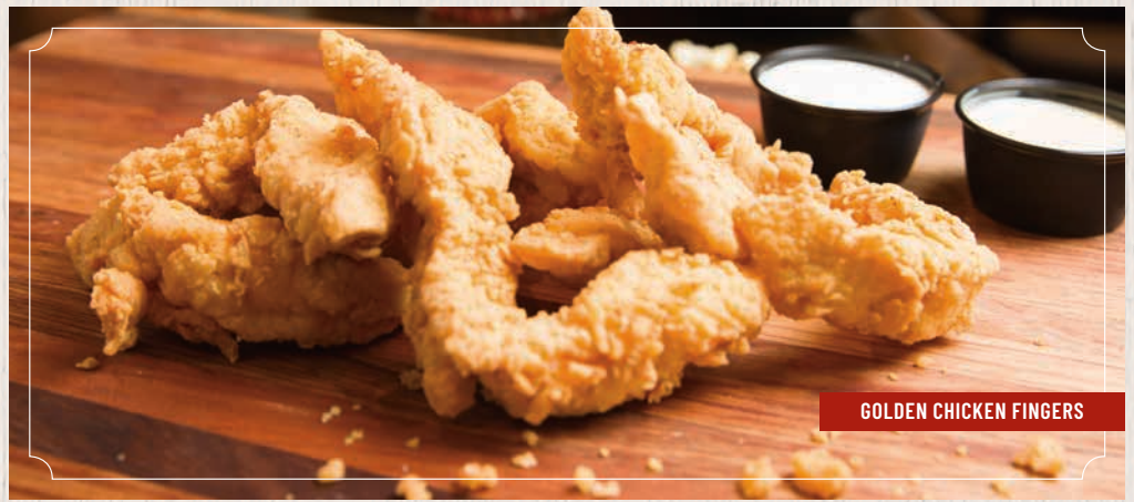
GOLDEN CHICKEN FINGERS

Honey Mustard • Ranch • BBQ • Buffalo Honey Garlic • Garlic Parmesan