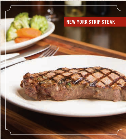
NEW YORK STRIP STEAK

Served with soup or salad, bread & butter, potato/side choice, and roasted vegetables..