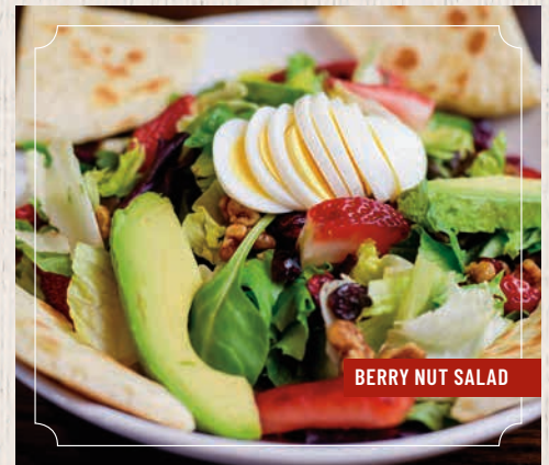
BERRY NUT SALAD

Grilled chicken quesadilla with pico de gallo and melty cheese, over romaine lettuce, cheddar jack cheese, crisp chopped bacon, grape tomatoes, cucumbers, avocado, and crispy onion strings. Served with BBQ sauce on top and ranch dressing on the side / 18.99