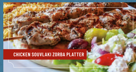
CHICKEN SOUVLAKI ZORBA PLATTER

ADD A CUP OF SOUP TO YOUR SANDWICH starting at 4.99