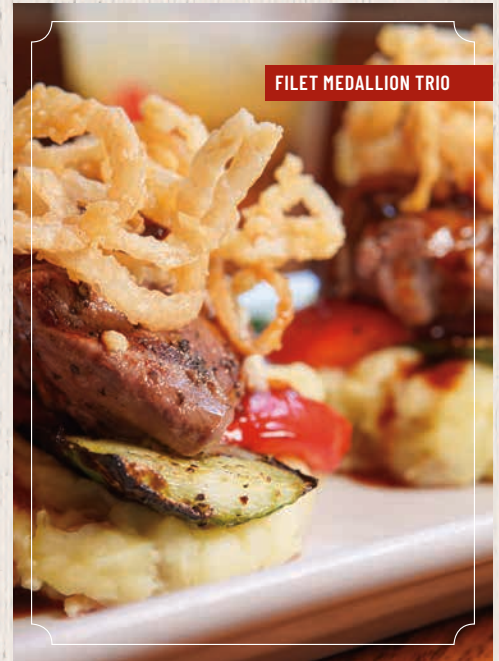
FILET MEDALLION TRIO