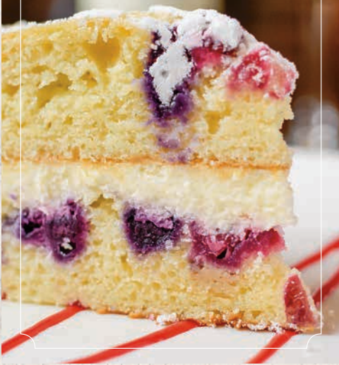
LEMON BERRY MASCARPONE CAKE