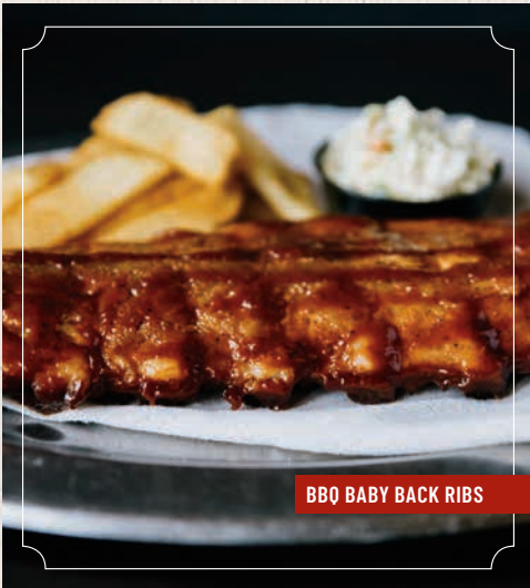
BBQ BABY BACK RIBS

Marinated & panko crusted chicken breast, grilled with butter and topped with diced tomato, feta, olive oil, lemon and a touch of garlic. Served with rice pilaf and grilled vegetables / 22.49