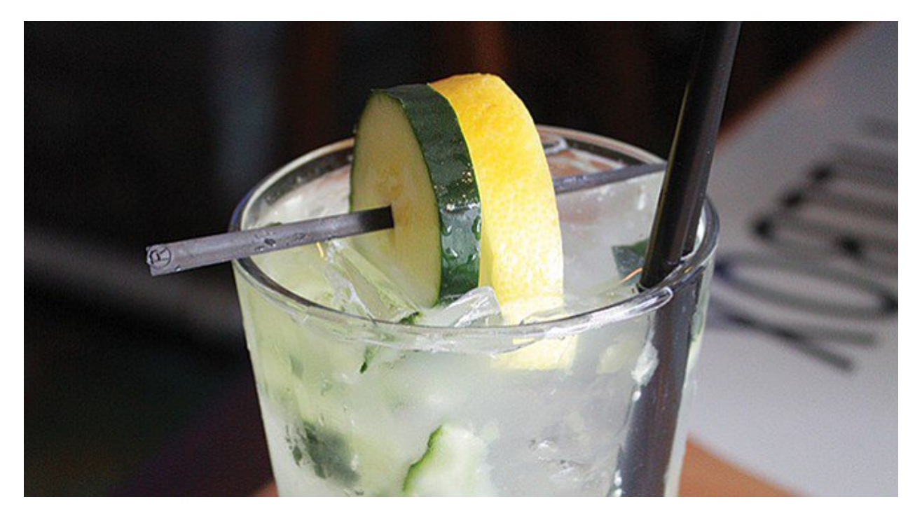
"The gin keeps everything in balance."