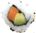
Salmon Avocado Roll*