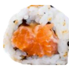
Spicy Salmon Roll*