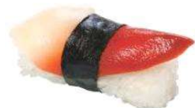
Hokkigai Surf Clams*