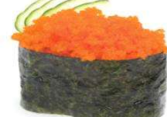
Masago Smelt Roe*