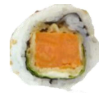
Sweet Potato Roll