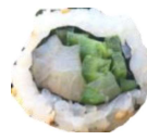
Yellowtail Jalapeno Roll*