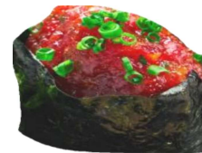
Pirikara Maguro Spicy Tuna*