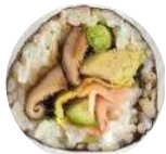
Mushroom Avocado Roll