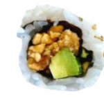
Peanut Avocado Roll