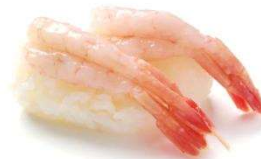
Amaebi Sweet Shrimp*