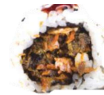
Salmon Skin Roll