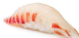
Madai Red Snapper*