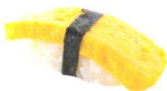
Tamago Sweet Egg