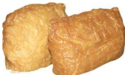
Inari Tofu Skin