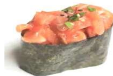
Tsurai Hamachi Spicy Yellowtail