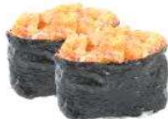
Tsurai Sake Spicy Salmon*