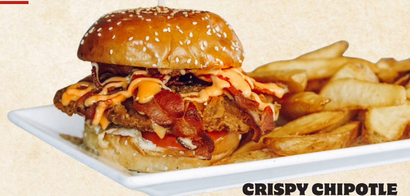
CRISPY CHIPOTLE CHICKEN

Crispy chicken breast tossed in hot honey, with mayo, pickles, and house-made coleslaw.