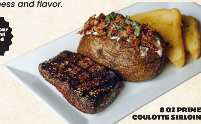
8 OZ PRIME COULOTTE SIRLOIN

Try it with our chimichurri compound butter!