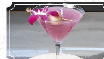
L01. Pink Lychee Martini ..... 15