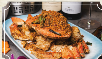
F04. Wok Tossed Dungeness Crab in Dry Garlic HK Style 避風塘炒蟹 ..... 68.99