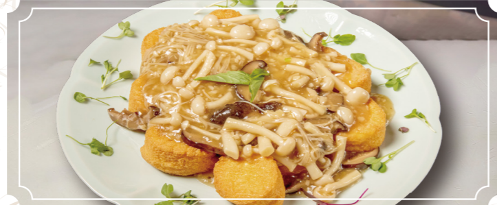
G05. Braised Japanese Egg Tofu W/ Assorted Mushroom 雙菇扒玉子豆腐 ..... 24.99