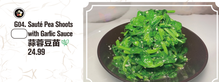
G04. Sauté Pea Shoots with Garlic Sauce 蒜蓉豆苗 ..... 24.99