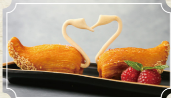
J03. Golden Swan Durian Puff (2) 榴蓮酥 ..... 10.99