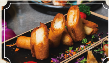
J05. Crispy Milk Custard 炸鮮奶 ..... 8.99