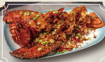
F02. Wok Fried Lobster in Garlic Sandstorm 避風塘龍蝦 ..... 40/lbs