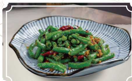
G01. Sichuan Green Beans 乾煸四季豆 ..... 18.99