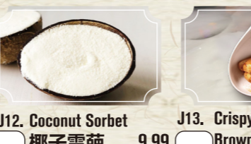
J12. Coconut Sorbet 椰子雪葩 ..... 9.99