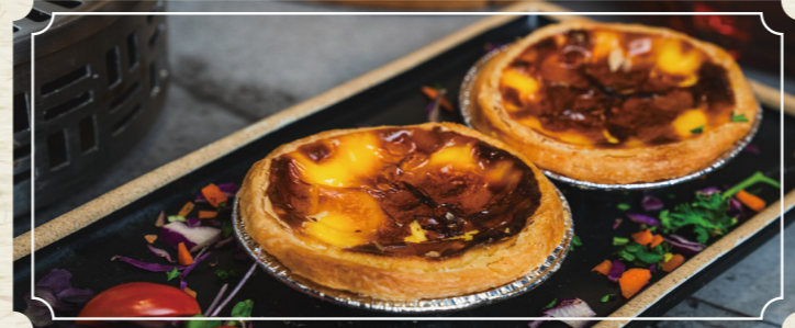
J02. Portuguese Style Egg Tarts 澳門葡撻 ..... 8.99