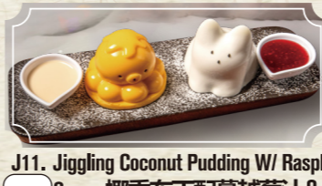
J11. Jiggling Coconut Pudding W/ Raspberry Sauce 椰香布丁配蔓越莓汁 8.99 Mango Pudding 香芒布丁 ..... 8.99