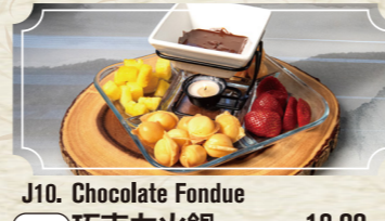
J10. Chocolate Fondue 巧克力火鍋 ..... 18.99