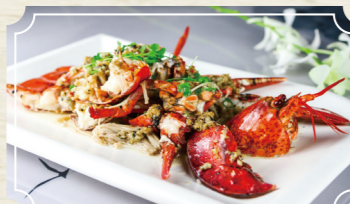
F05. Steamed Lobster w/ Garlic Vermicelli 蒜蓉粉絲蒸龍蝦 ..... 40/lbs