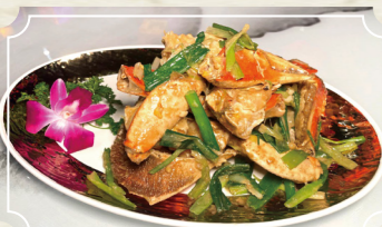
F03. Stir Fried Crab w/ Ginger and Scallions 薑蔥炒蟹 ..... 68.99