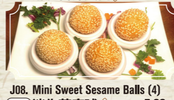
J08. Mini Sweet Sesame Balls (4) 迷你芝麻球 ..... 5.99