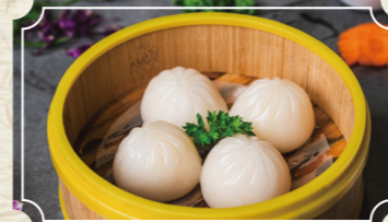
J01. Steam Custard Dumplings (4) 奶黃水晶包 ..... 7.99