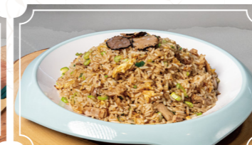
K02. Black Truffle Duck Fried Rice Italian Summer Truffle Slices, Black Truffle Sauce, Asparagus 黑松露鴨肉炒飯 ..... 25.99