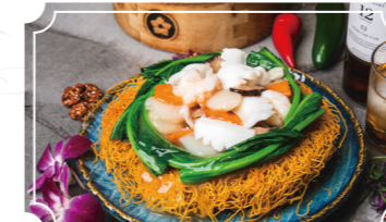
K06. Crispy Noodles w/ Exotic Seafood Crispy Egg Noodle with Exotic Seafood 海鮮香煎麵 ..... 25.99