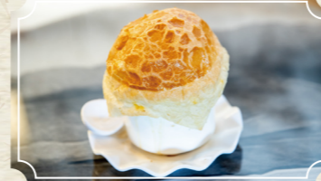
J06. Baked Almond Egg White Sweet Tea 酥皮杏仁蛋白 ..... 12.99