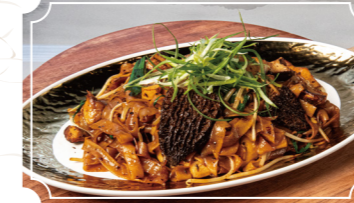
K03. Black Truffle Morel Mushroom Chow Fun Black Truffle, Morel Mushroom, Flat Rice Noodle 黑松露羊肚菌鮮菇炒河粉 ..... 36.99