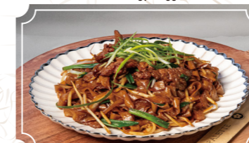
K01. Wagyu Beef Chow Fun* Rice Noodles, Bean Sprout, Chinese Chive, Scallion 和牛炒河粉 ..... 25.99