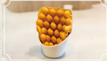
J07. Hong Kong Style Egg Waffle 懷舊雞蛋仔 ..... 8.99