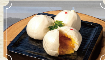
J04. Salted Egg Lava Bao (Lau Sa Bao) 黃金流沙包 (3) ..... 7.99