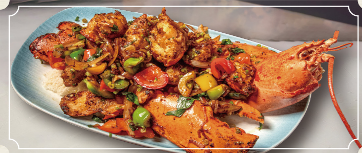
F01. Palette Signature Lobster with Basil & Black Pepper Sauce 彩宴特式龍蝦 ..... 40/lbs