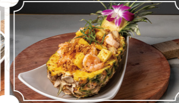
K05. Pineapple Seafood Fried Rice Cashew Nuts, Shrimp, Scallops, Cuttlefish 菠蘿海鮮炒飯 ..... 28.99