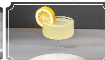
L02. Palette Lemon Drop ..... 15