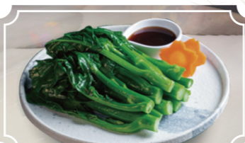
G03. Poached Chinese Kale (Gai Lan) 蠔油芥蘭 ..... 18.99