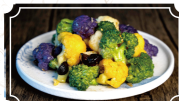
G02. Black Garlic Stir-Fried Three Color Cauliflower 大蒜三色菜花 ..... 20.99