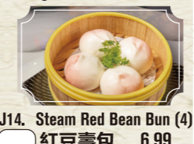
J14. Steam Red Bean Bun (4) 紅豆壽包 ..... 6.99