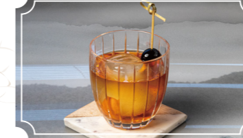
L03. Palette Old Fashion ..... 15