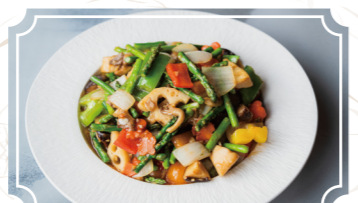
G06. Sauté Asparagus & Assorted Mushrooms 蘆筍炒什菌 ..... 22.99