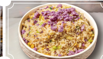
K07. Palette Vegetable Fried Rice Tri-Color Cauliflower, Asparagus, Scallion, Egg 三色菜花蘆筍素炒飯 ..... 18.99