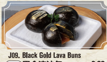
J09. Black Gold Lava Buns 黑金流沙包 ..... 8.99