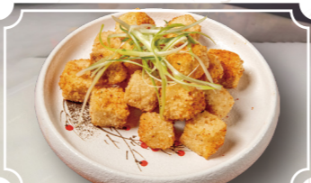
G07. Crispy Salt and Pepper Tofu 椒鹽脆豆腐 ..... 8.99