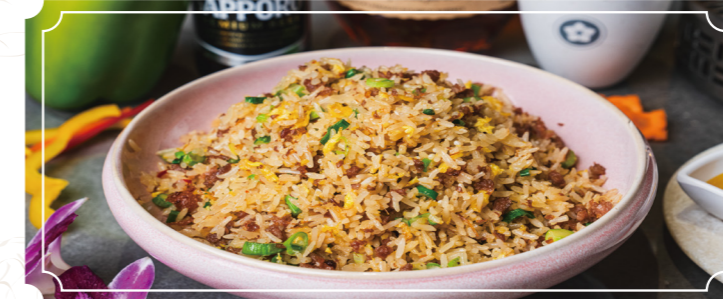
K04. XO Sauce Wagyu Beef Fried Rice XO醬和牛炒飯 ..... 25.99 Minced Wagyu, Egg, XO Sauce, Green Onion