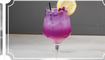
L04. Purple Sky ..... 15

圖片只供參考 Photos are only for illustrations of the actual food.