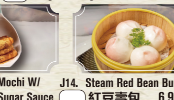
J13. Crispy Mochi W/ Brown Sugar Sauce 紅糖糍粑 ..... 8.99