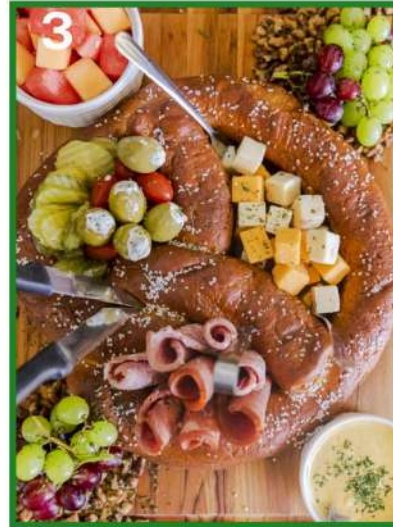
3 CHOOSE FOOD MENU