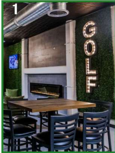
1 CHOOSE YOUR ROOM