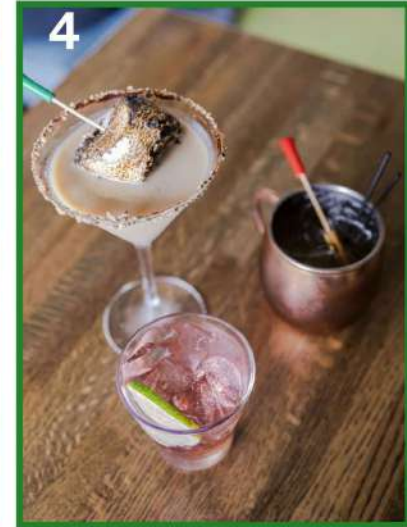
4 CHOOSE ENHANCEMENTS