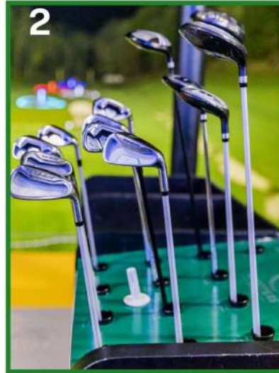
2 CHOOSE TO ADD TOPTRACER HEATED GOLF BAYS