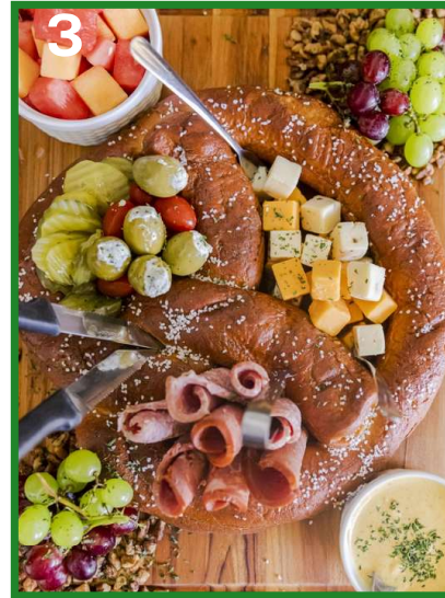
CHOOSE FOOD MENU