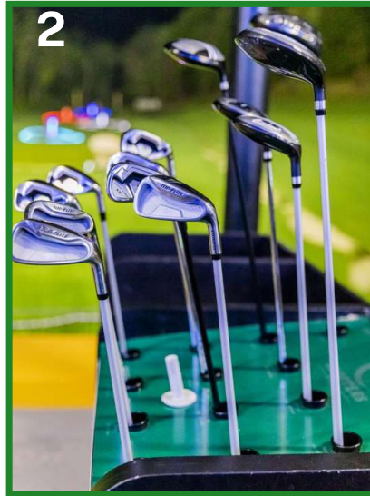
CHOOSE TO ADD TOPTRACER HEATED GOLF BAYS