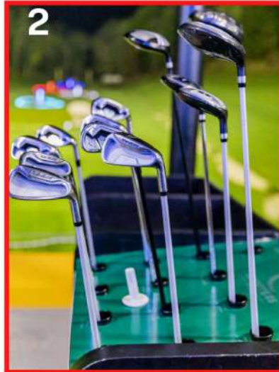
2 CHOOSE TO ADD TOPTRACER HEATED GOLF BAYS