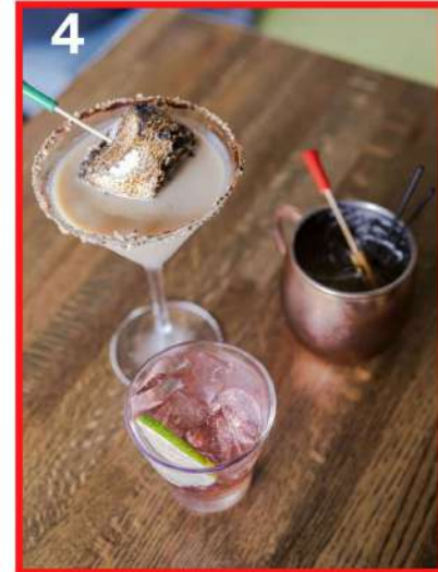
4 CHOOSE ENHANCEMENTS