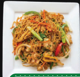
KOKO STIR FRY NOODLES