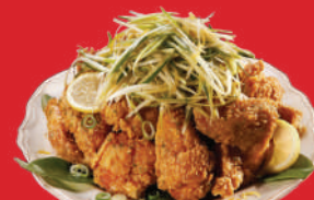
LEMON SPRING ONION