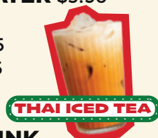
THAI ICED TEA

Mango, watermelon, melon, strawberry, and more $5