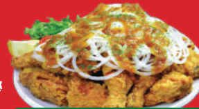
CURRY SWEET ONION