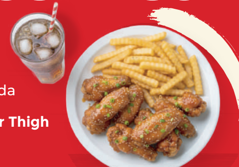
WINGS LUNCH SPECIALS

SAUCES: Original, Honey Garlic, Curry, Soy Garlic