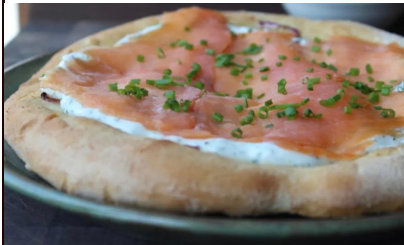
Smoked Salmon Pizza with chives and creme fraiche