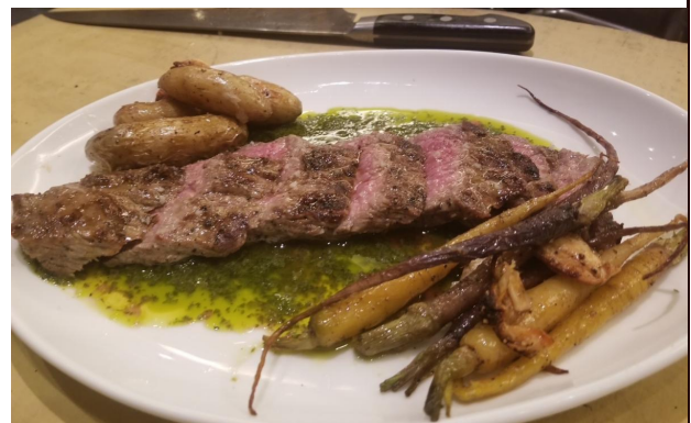
Grilled Hanger Steak with Chimichurri and fingerling potatoes