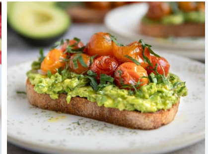
Avocado Toast with cherry tomatoes on country bread