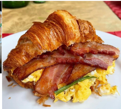
Croissant with cheesy scrambled eggs and bacon