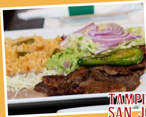
TAMPIQUEÑA SAN JOSE