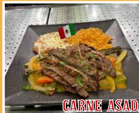
CARNE ASADA ALA MEXICANA