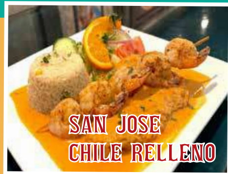
SAN JOSE CHILE RELLENO

Simmered pork skin, and neck. Served with rice and beans, pico de gallo, hot salsa, tortillas. 18.99