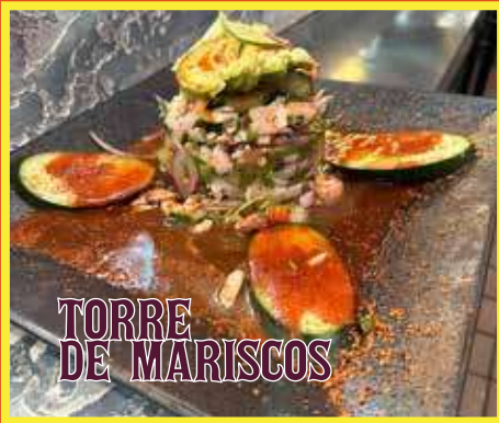
TORRE DE MARISCOS