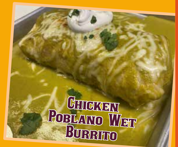
CHICKEN POBLANO WET BURRITO