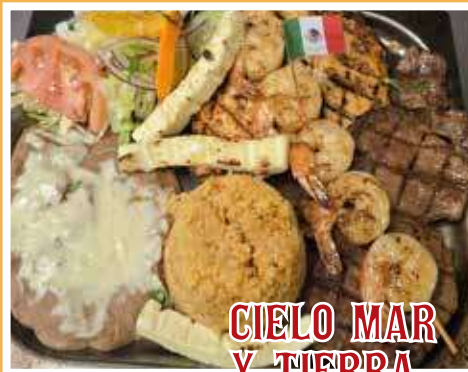
CIELO MAR Y TIERRA

Rin-eye steak, shirmp diabla, grilled chicken. Served white rice, beans, salad and tortillas. 26.99