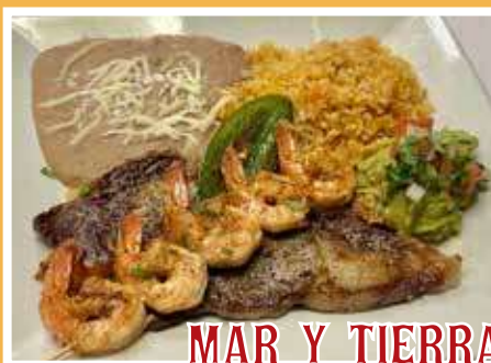
MAR Y TIERRA

Rib-eye steak, shrimp, guacamole, rice, beans and tortillas. 21.99