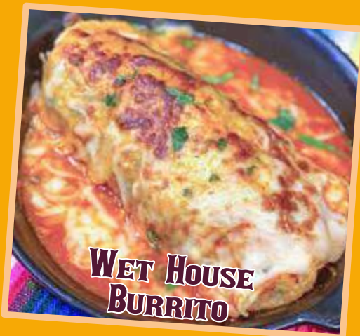
WET HOUSE BURRITO