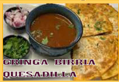
GRINGA BIRRIA QUESADILLA

3 Corn tortilla with cheese and birria meat, served with beef broth, onions and cilantro. 16.49 Add rice and beans. 3.49