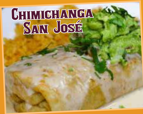
CHIMICHANGA SAN JOSÉ

CHIMICHANGA SAN JOSÉ Fried flour tortilla topped with cheese, queso dip and guacamole. Served with rice and beans. 17.49 -Chicken -Steak -Pastor -Ground Beef