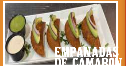
EMPANADAS DE CAMARON