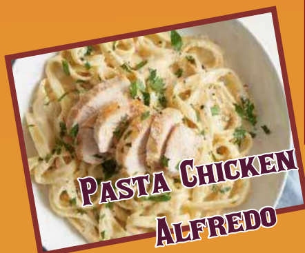
PASTA CHICKEN ALFREDO

Steak, cheese, lettuce and tomato, served with French fries 14.99 •Only Burger 10.99