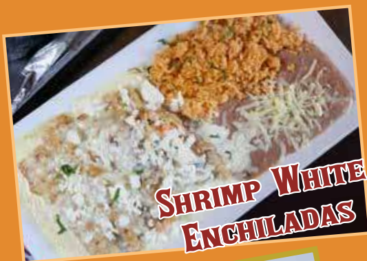
SHRIMP WHITE ENCHILADAS