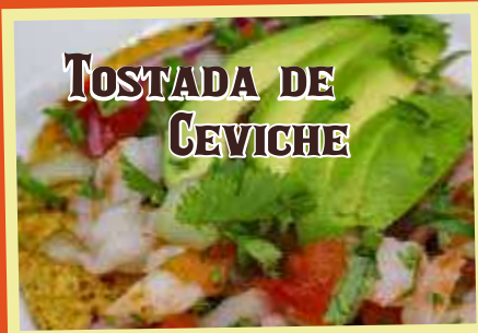
TOSTADA DE CEVICHE