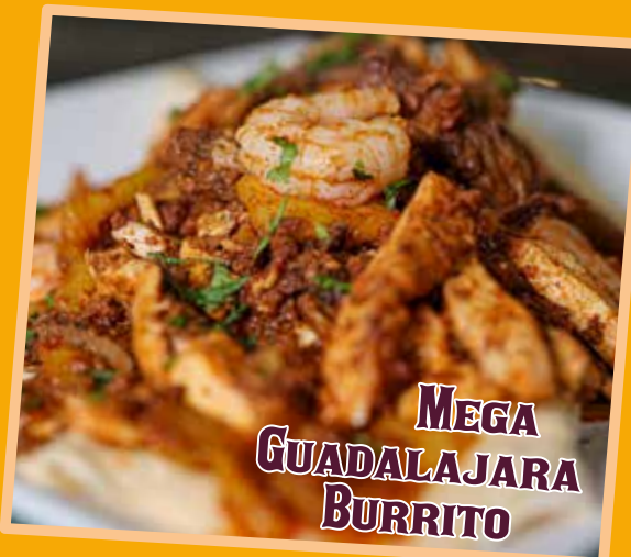
MEGA GUADALAJARA BURRITO

14" Flour tortilla rice and beans, steak, chicken, pineapple, chorizo, shrimp, queso dip. 16.99