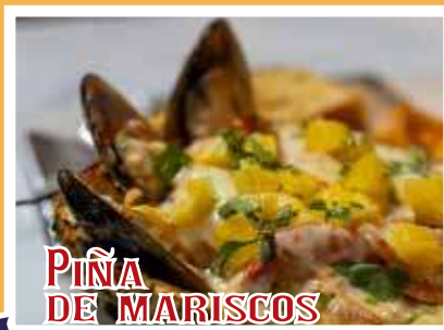
PIÑA DE MARISCOS