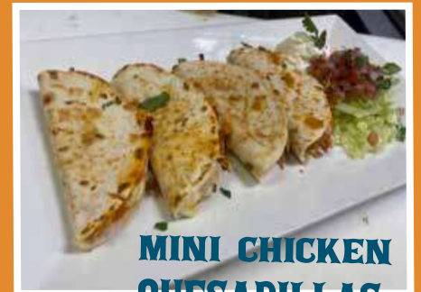
MINI CHICKEN QUESADILLAS