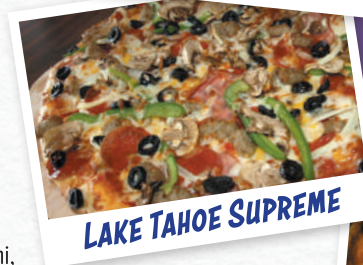
LAKE TAHOE SUPREME

mushrooms, red onion, bell peppers, black olives, canadian bacon, pepperoni, italian sausage