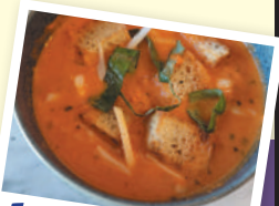
TOMATO BISQUE SOUP

sourdough baguette toasted with mozzarella, cheddar cheeses