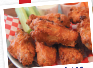
BLUE DOG WINGS