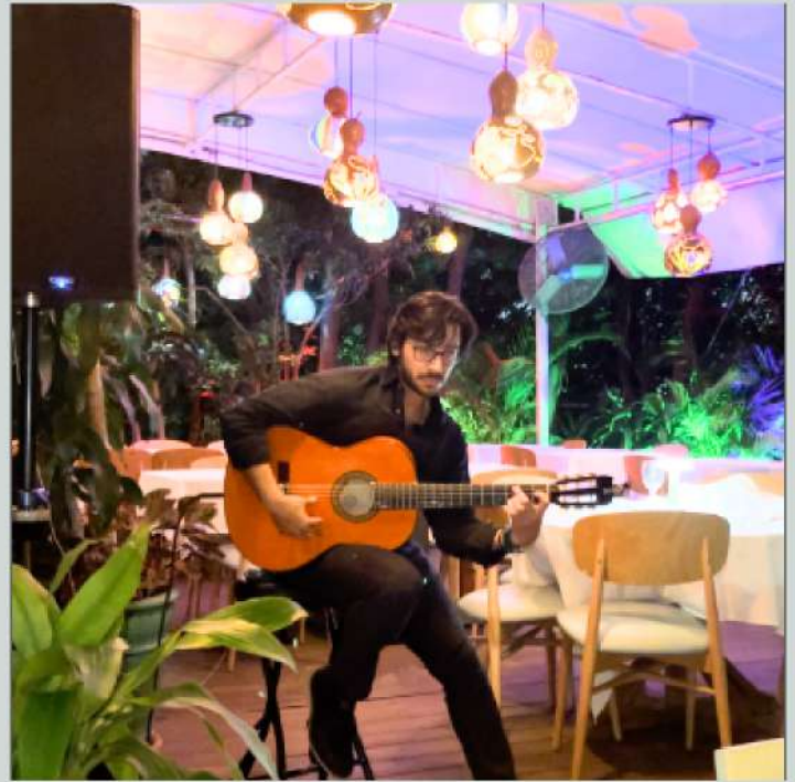
Live Guitar Performance