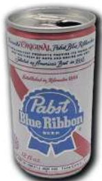
-PABST FIXED-TAB CAN-

The first fixed-tab can was produced in 1975 and is still used today by almost every brewery in country.