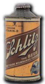
-SCHLITZ CONE TOP CAN-

This design allowed brewers to use their bottle and packaging lines to fill cans seal them with bottle caps.