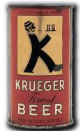
-KRUEGER FIRST BEER CAN-

The first beer can was developed in 1933 by American Can, for Gottfried Krueger's Brewing Company.