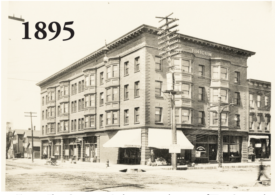
Tinicum Flats. Circa, 1985. Built in 1889 at the corner of Water Street and Highland Avenue, this queen anne/Neoclassical style apartment building was the design of the Milwaukee architecture firm, Ferry & Clas.