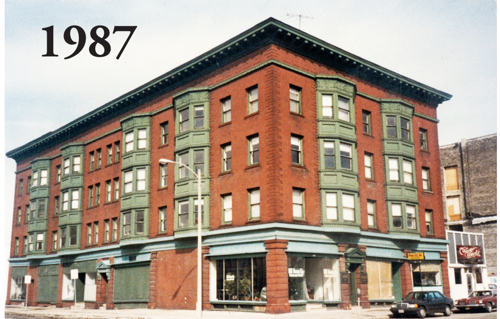
Tinicum Flats was home to a resale shop and wholesale florist in 1987 when the Water Street Brewery purchased this endangered historical building. After extensive remodeling and the addition of a brewing system the Water Street Brewery opened in 1987.