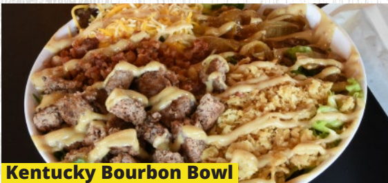
Kentucky Bourbon Bowl

Fried Egg 1.99 Extra Patty 2.99 Bacon 2.99 Grilled Onions .99 Jalapeños .99 Guacamole 1.49 Sour Cream .49 Mushrooms .99