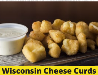
Wisconsin Cheese Curds