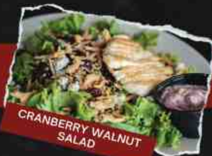
CRANBERRY WALNUT SALAD

Chopped romaine lettuce tossed with Parmesan cheese, croutons and Caesar dressing. 8.99