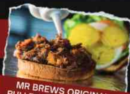
MR BREWS ORIGINAL PULLED PORK SANDWICH

Pulled pork topped with BBQ sauce, coleslaw and pickles on the side. 11.49