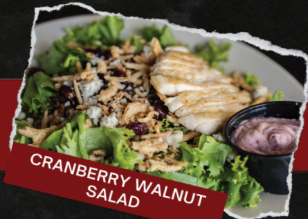
CRANBERRY WALNUT SALAD

Crisp greens topped with walnuts, dried cranberries, bleu cheese crumbles and crispy french-fried onions. Served with creamy cranberry dressing. 7.99