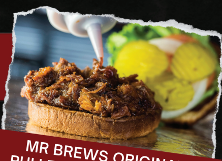
MR BREWS ORIGINAL PULLED PORK SANDWICH

Pulled pork topped with BBQ sauce, power slaw and pickles on the side. 9.59