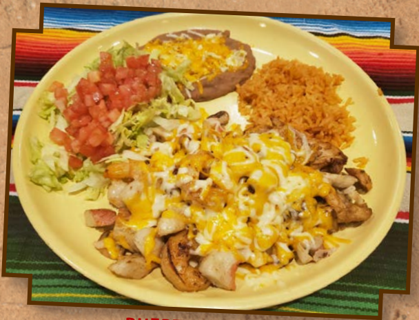
PUERTA VALLARTA PLATTER

TENDER SHREDDED PORK BURRITO SERVED WITH PICO DE GALLO, RICE AND BEANS, COVERED WITH RED SAUCE.