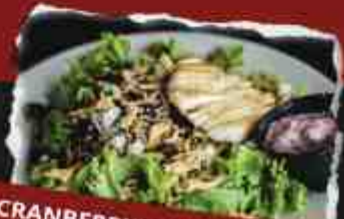
CRANBERRY WALNUT SALAD

Crisp greens topped with walnuts, dried cranberries, bleu cheese crumbles and crispy french-fried onions. Served with creamy cranberry dressing. 10.99