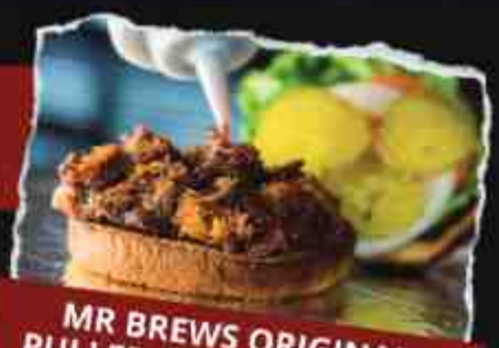
MR BREWS ORIGINAL PULLED PORK SANDWICH

Beer battered cod strips, deep fried and served with tartar sauce, lemon and fries or chips. 12.99