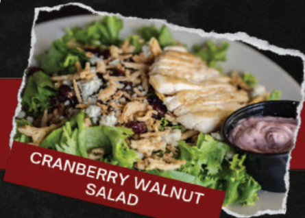
CRANBERRY WALNUT SALAD

Crisp greens topped with walnuts, dried cranberries, bleu cheese crumbles and crispy french-fried onions. Served with creamy cranberry dressing. 9.99