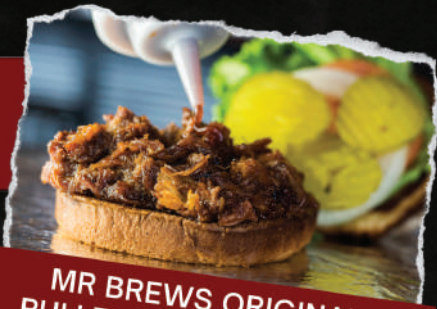
MR BREWS ORIGINAL PULLED PORK SANDWICH

Pulled pork topped with BBQ sauce, power slaw and pickles on the side. 10.99