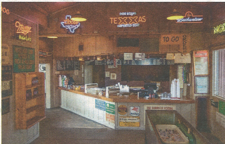
The Peacocks jumped feet first into the restaurant industry, and have learned steadily along the way.

As the restaurant's reputation grew, the catering side of the business has required more attention. Just when the team had become comfortable catering barbecue for 100, a group called asking if they could serve 1100 guests. "We hit it hard, and dedicated all our cooking spaces to the effort. Then four days before the event, they called and let us know the guest count would be 1700!" Stewart recalls. In order to balance logistics, staff, and available space, the Peacocks temporarily shut the doors of The Station to meet the demands of their biggest-